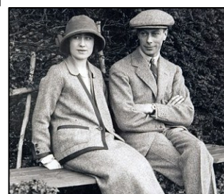
Queen Mother & King George VI