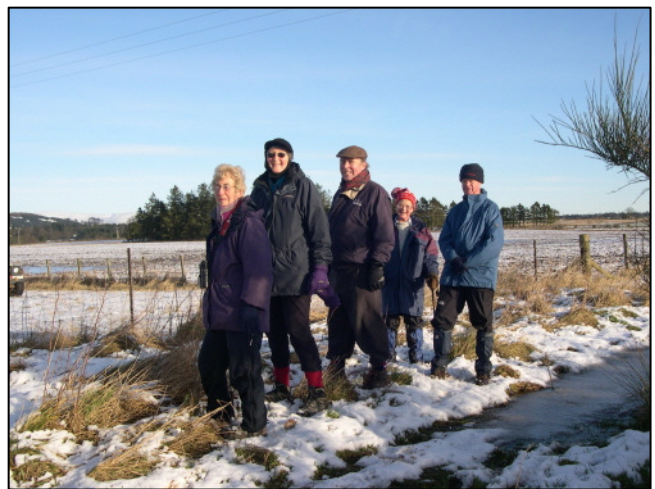
Heading towards Herdhill